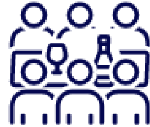
Community (RAC, Fellows, MGRs, VTCs, etc.)